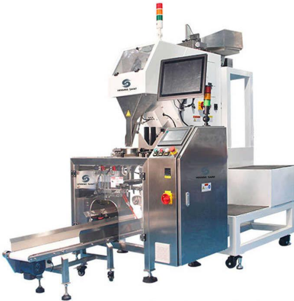
HS-VB60 packaging solution

With professional optimization algorithm and unique control technology, Henning Saint can design special counting equipment or modules for different customers with different precision requirements, Through computer image processing to achieve high-precision counting, helping customers to create packaging automation and achieve low-cost, high-efficiency production. Henning Saint visual counters break the bottleneck of manual counting and weighing, ensuring accurate counting while avoiding the scratches or contamination that manual counting can cause. The equipment is widely used in hardware, fasteners, electronic parts, plastic parts and other industrial industries, agricultural seed industry, pharmaceutical and food industry customers for accurate high-speed counting of particles urgent needs.