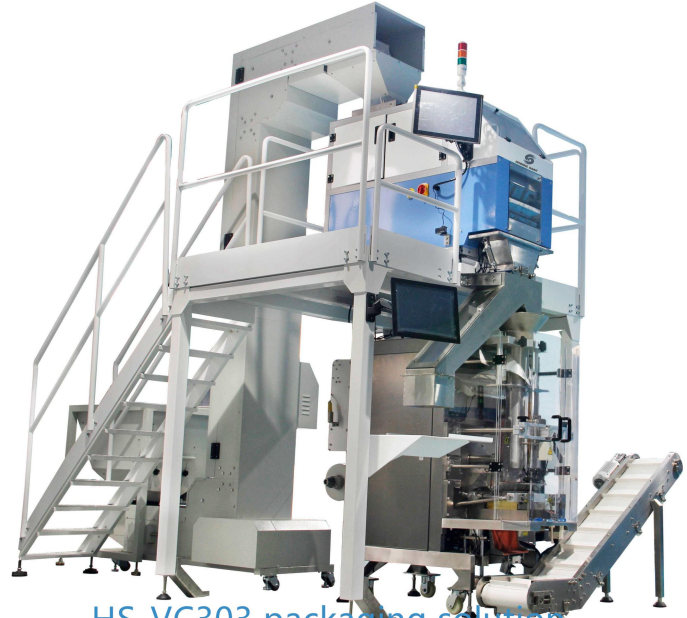
HS-VC303 packaging solution