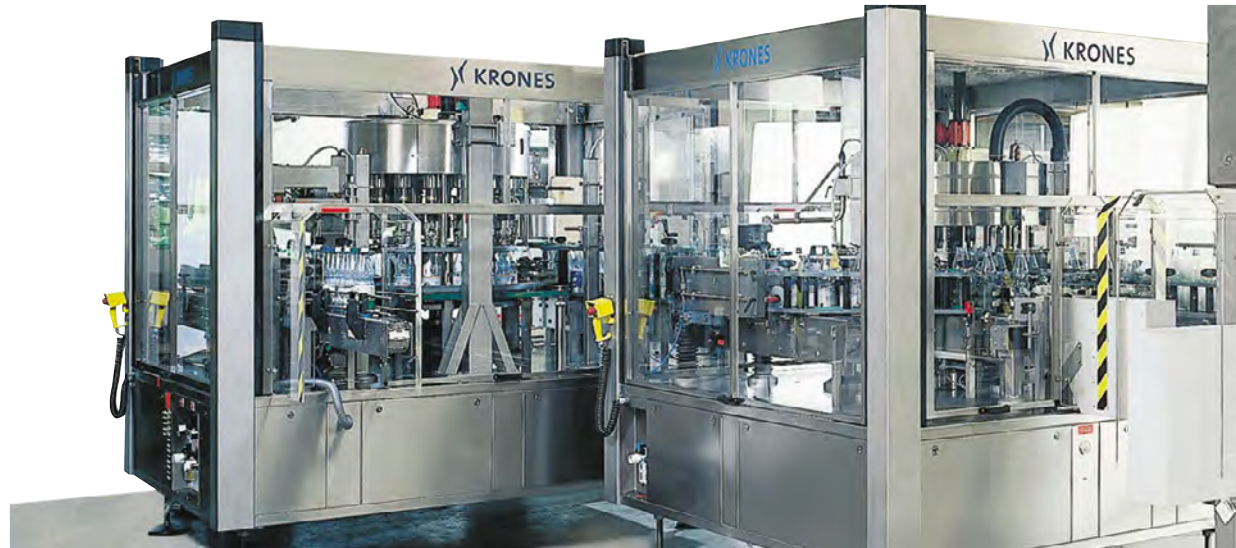
Rotomat decapper (left) and delabeller (right) in block

The Rotomat decapper has a modular design and can be flexibly adapted to the local conditions of any plant. The infeed and discharge situation can each be designed for either a right-left or left-right machine.