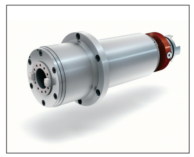
The UMC-750 comes standard with an inline direct-drive spindle that spins to 8100-rpm. For high-speed work, a 12,000-rpm inline directdrive spindle is available.