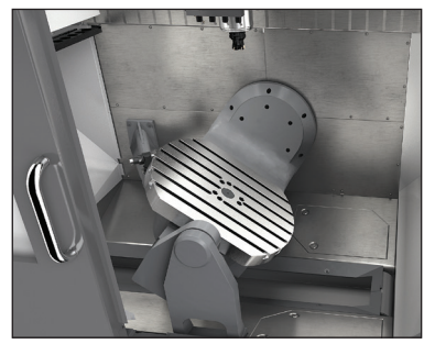
The UMC-750's integrated dual-axis trunnion table can position parts to nearly any angle for 5-sided (3+2) machining, or provide full simultaneous 5-axis motion for contouring and complex machining.

The UMC-750's 630 x 500 mm trunnion table features standard T-slots, as well as a precision pilot bore, for fixturing versatility. The trunnion provides +110 and -35 degrees of tilt and 360 degrees of rotation to provide excellent tool clearance and large part capacity.