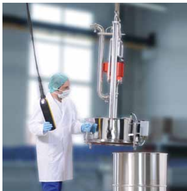
Mobile use with crane or fork lift truck.