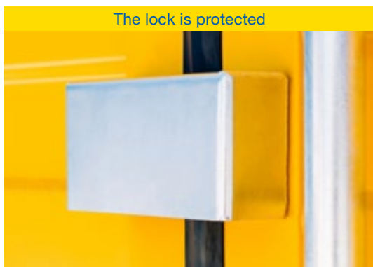
The lock is protected