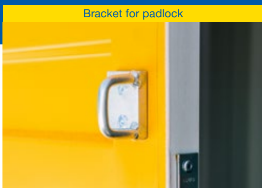
Bracket for padlock