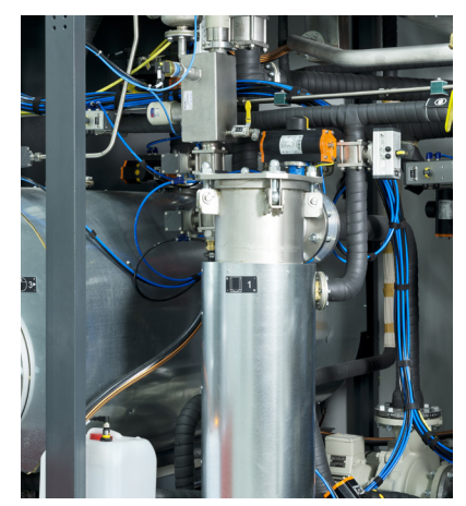
Filter monitoring and drying