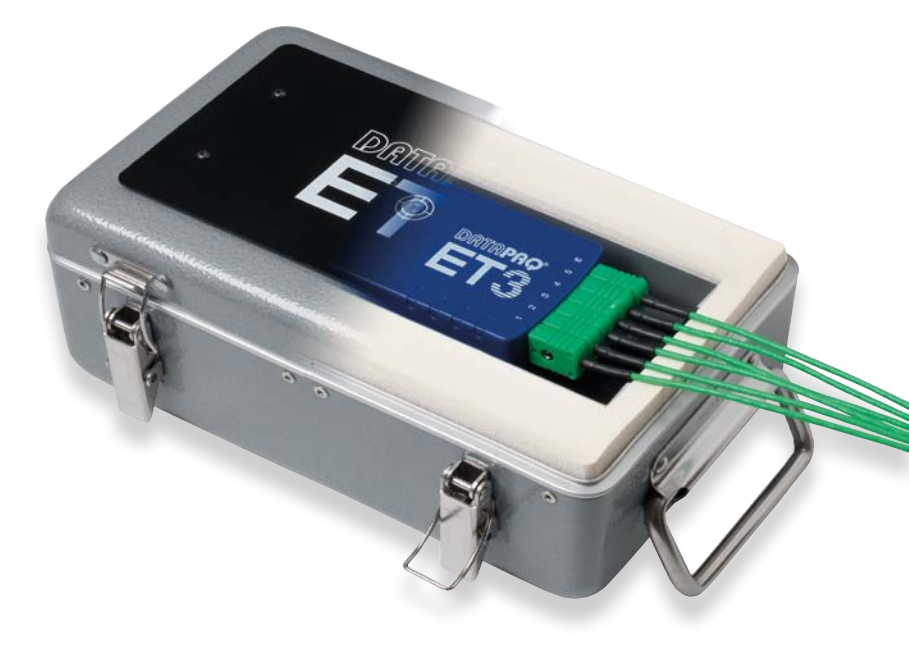
Thermal barrier DATAPAQ TB0263*

DATAPAQ EasyTrack3 system with standard TB0253 thermal barrier