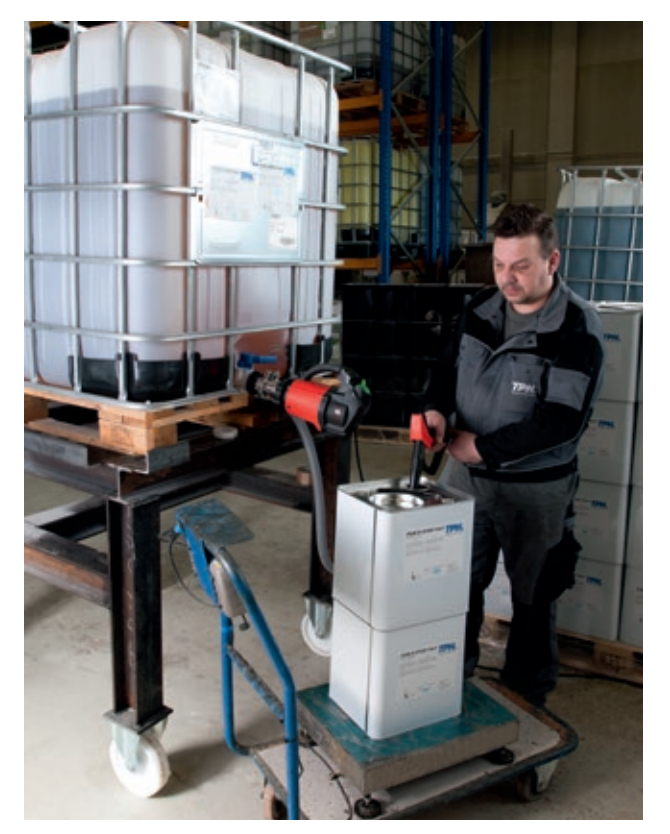
Fast container filling from the IBC outlet.