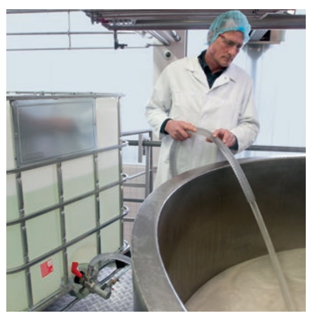
Pumping upward into a mixing container from the IBC outlet.