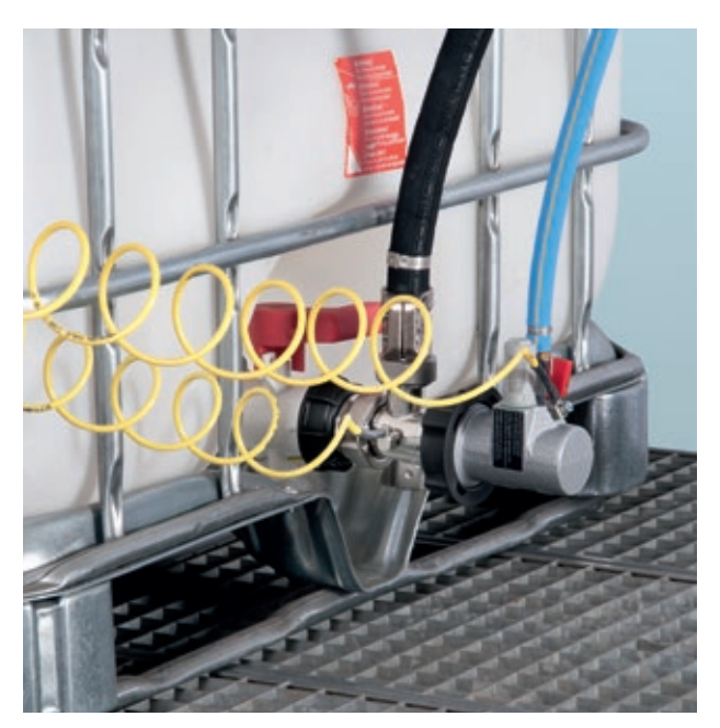
Also suitable for use in explosion hazard areas of zone 1.**