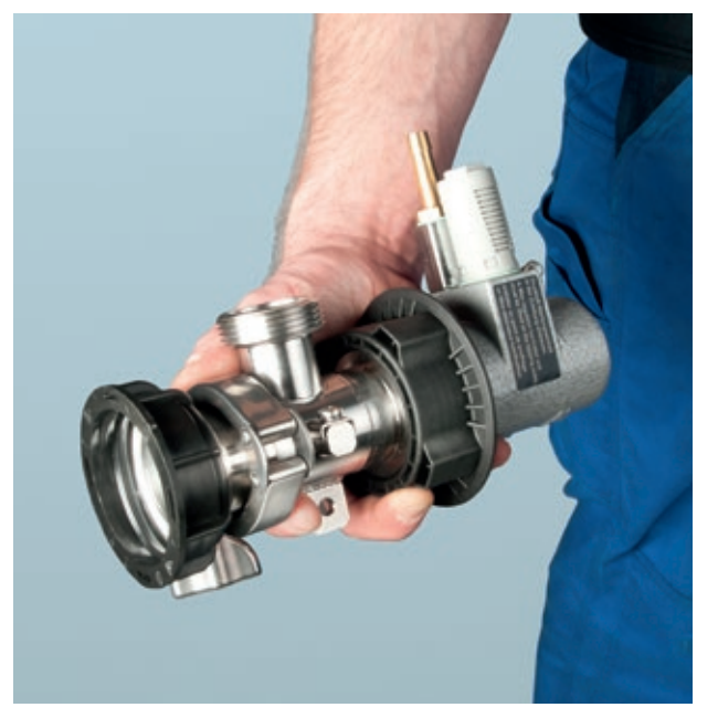
Extremely compact and light.