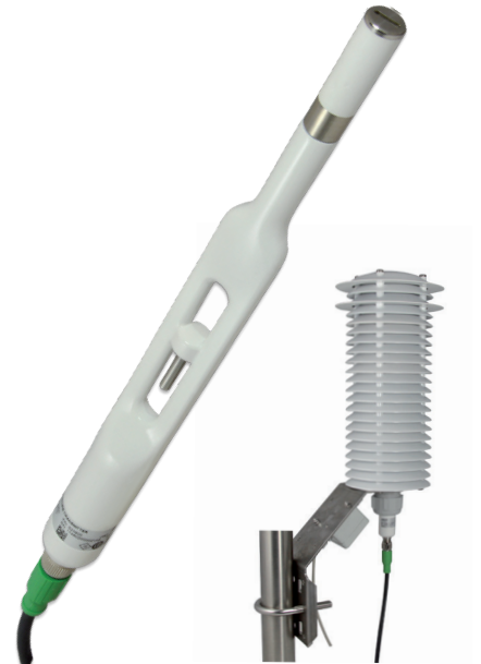
EE260 with radiation shield

An optional configuration adapter and the free PCS10 Product Configuration Software facilitate the configuration and adjustment of the EE260.