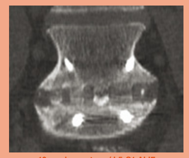
10 weeks post-op / L5-S1 ALIF