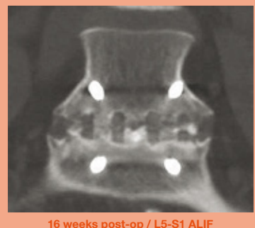
16 weeks post-op / L5-S1 ALIF