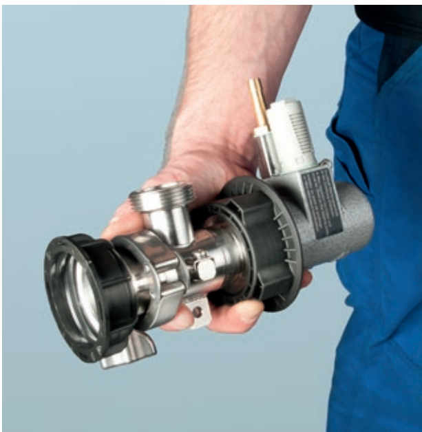
Extremely compact and light.