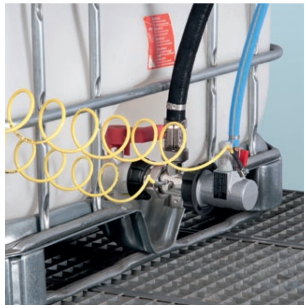
Also suitable for use in explosion hazard areas of zone 1.**