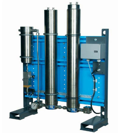
Bypass Filter System