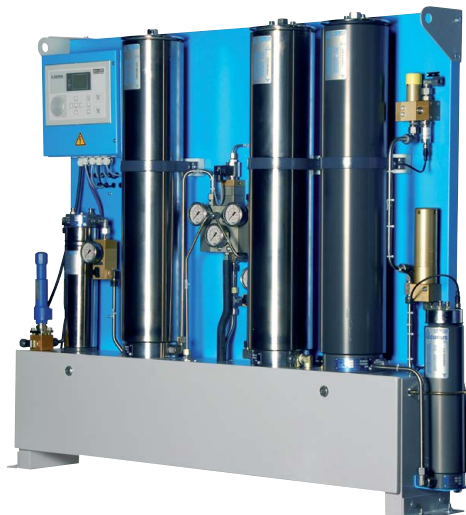
SECCANT 4 / 4A