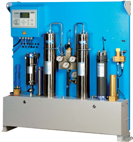
SECCANT 3 / 3A