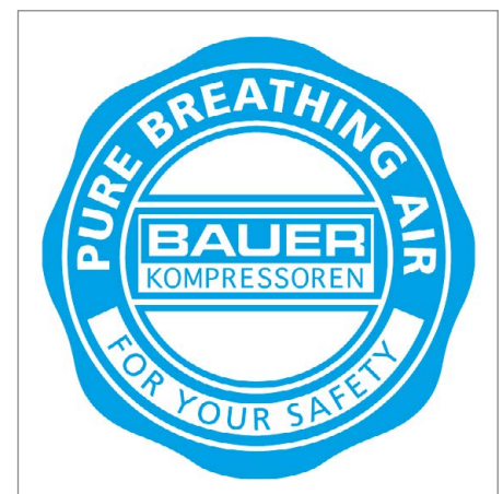
The quality seal of an original BAUER cartridge for pure breathing air according to DIN EN 12021 1 .

ensures, in the event of fluctuating final pressures, an optimal working pressure in the filter housing, allowing for an efficient adsorption of the oil and water molecules.