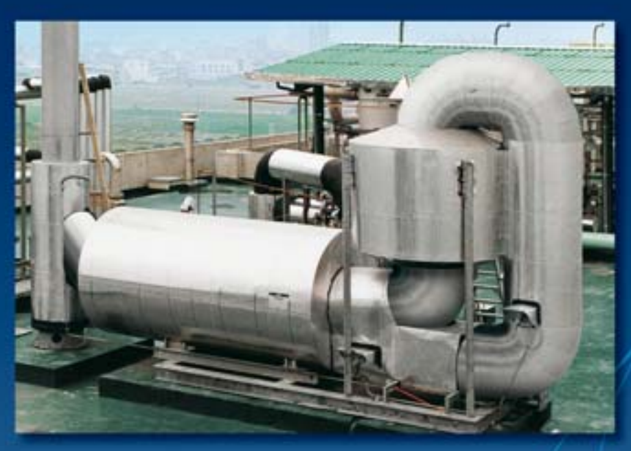
Sizes designed to handle flow rates up to 9 000 m_N^3 /h are delivered pre-assembled on a base frame (see sectional diagram); larger units are assembled on site.

The units are used for conventional VOC reduction and special applications such as NO<sub>x</sub> reduction, purification of exhaust air from stationary engines and for carbon monoxide (CO) removal from exhaust air flows.