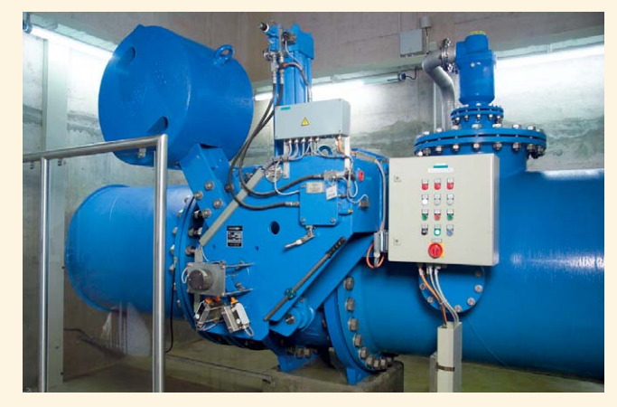
VAG-Armaturen GmbH, Mannheim, Germany