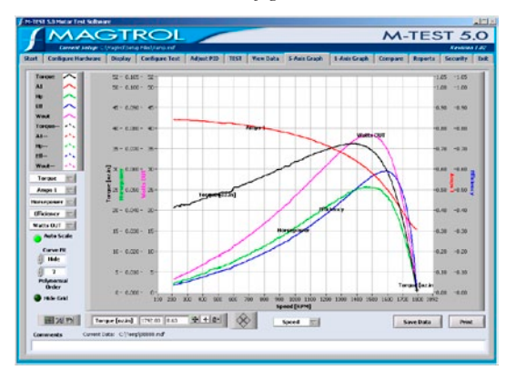
M-TEST 5.0 Graphical Data Output