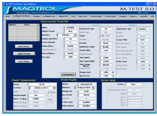
M-TEST 5.0 Hardware Configuration