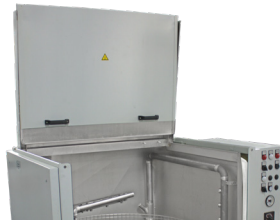
Hinged slide cover open