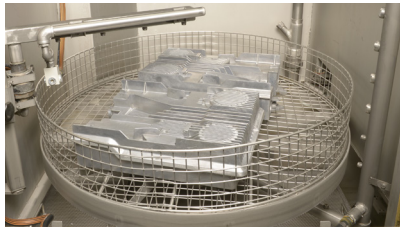
Blow-off pipe, height adjustable