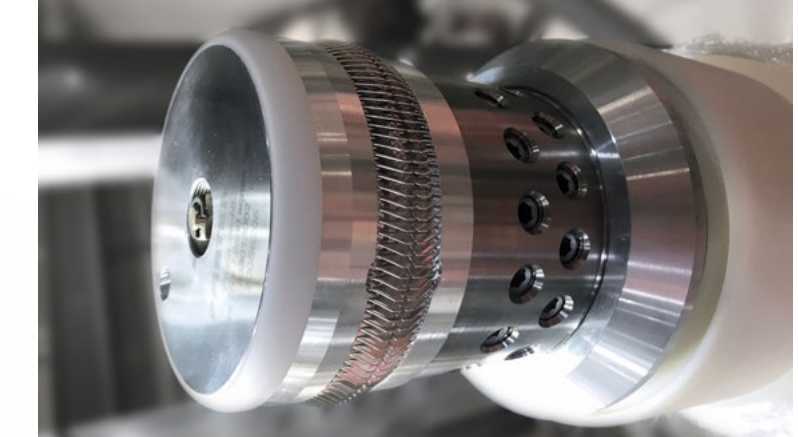
FrontCon: compact contact system for HV cable fittings.

Tightening the pressure screw presses the balls against the front face of the conductor ends. Reliable contact is established. A built-in spring mechanism compensates for settling losses. This ensures that contact forces and low transmission resistances are maintained at different temperatures and throughout the full service life.