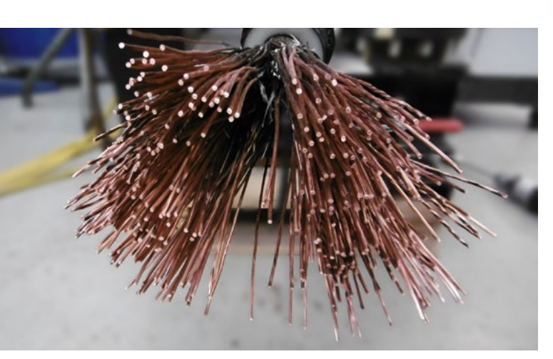
Previously, the connection process took around 16 hours.

Despite best efforts, the original conductor structure is not achieved at the installation site. Moreover, removing the insulation means losing the benefit of single-strand insulated cables at the end of the conductor. PFISTERER has completely rethought the connection of singlestrand insulated conductors.