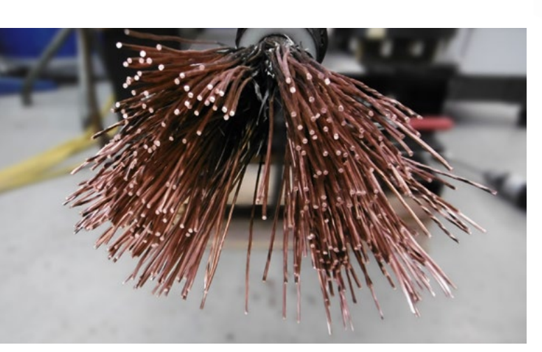
Previously, the connection process took around 16 hours.

Despite best efforts, the original conductor structure is not achieved at the installation site. Moreover, removing the insulation means losing the benefit of single-strand insulated cables at the end of the conductor. PFISTERER has completely rethought the connection of single-strand insulated conductors.