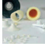
Injection moulding (CIM)