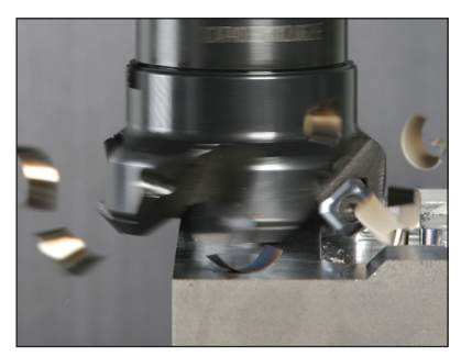
The Haas 50-taper spindle features a 22,4 kW vector drive system that provides 610 Nm of torque for heavy cuts.

The new Haas VF-3YT/50-taper VMC provides the heavy cutting capacity of a 50-taper machine in a mid-size footprint. It has a 1016 x 660 x 635 mm work envelope and a 1321 x 584 mm table – up 152 mm in Y over the standard Haas VF-3. A larger base casting provides the extended Y-axis travel, yet the machine's footprint is only slightly larger than the standard VF-3. Heavy cast-iron construction yields the rigidity and stability necessary for heavy cutting, and the wide T-slot table provides plenty of room for fixturing and large parts.