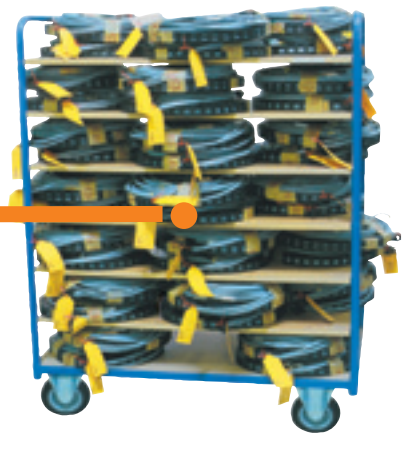
...to serial production