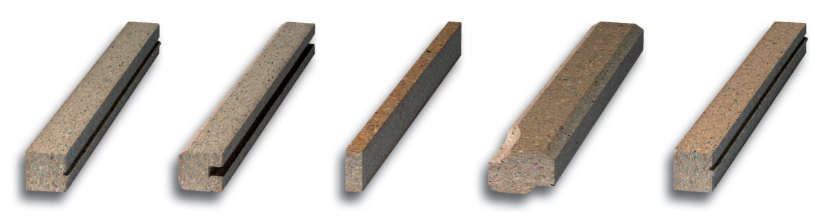
Our CNC machining center can manufacture individually tailored cuts for your particular application!

Our service for your individual requirements.