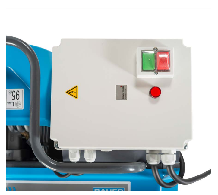
Compressor control for automatic condensate drain and switch off at final pressure, according to DIN EN 60204