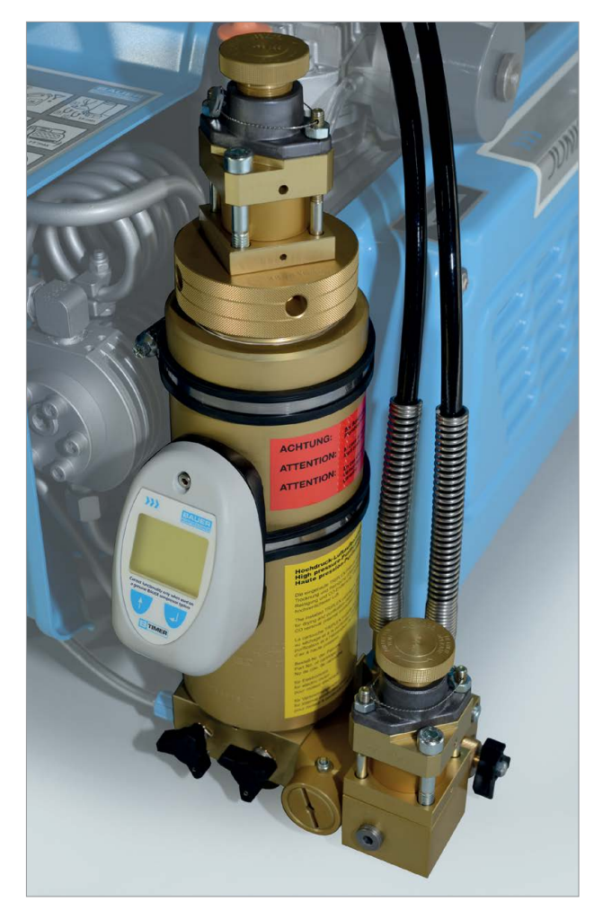
TRIPLEX purification system for purest air