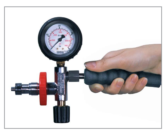
Stainless filling device