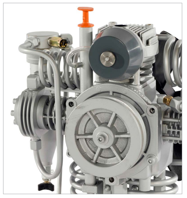
JUNIOR compressor block