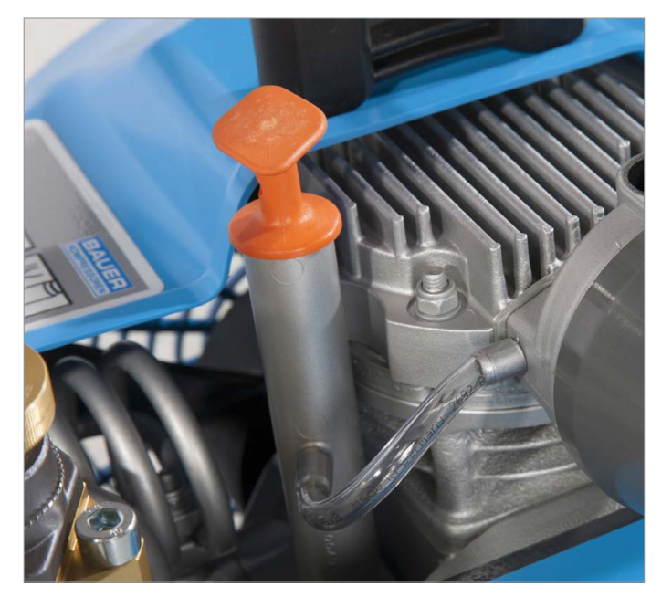
Oil filler neck with dipstick