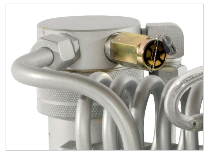
Sealed safety valve