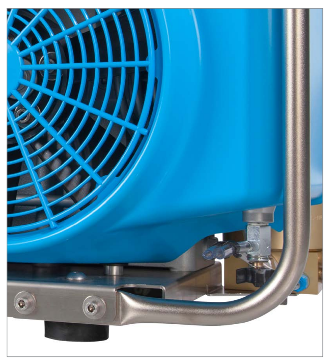
Stainless steel frame