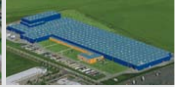
Hörmann KG Ichttershausen