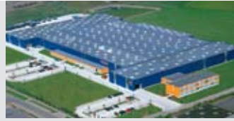
Hörmann KG Brandis