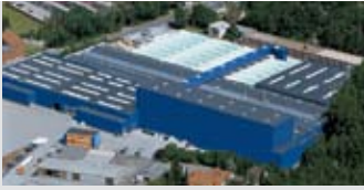
Hörmann KG Amshausen