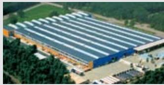
Hörmann Genk NV, Belgium