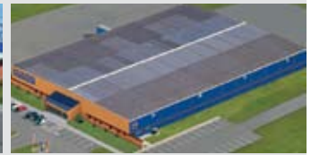
Hörmann Gadco LLC, Vonore TN, USA

Hörmann is the only manufacturer worldwide that offers you a complete range of all major building products from one source.