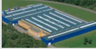
Hörmann KG Eckelhausen