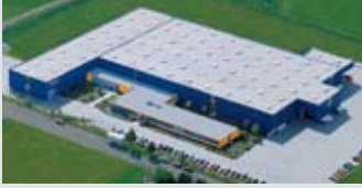
Hörmann KG Dissen