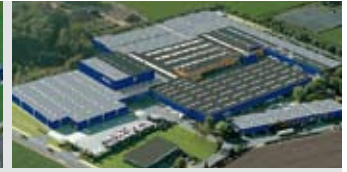
Hörmann KG Brockhagen