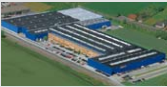
Hörmann KG Werne