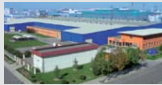
Hörmann Beijing, China