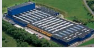
Hörmann KG Freisen