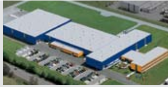
Hörmann KG Antriebstechnik