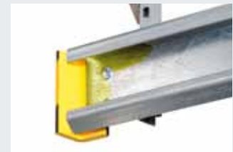
Track ends with shock-resistant cladding