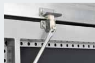
Automatic latching latch lock