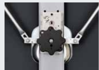
Interior handle, profile cylinder lock, locking rods in the equipment room