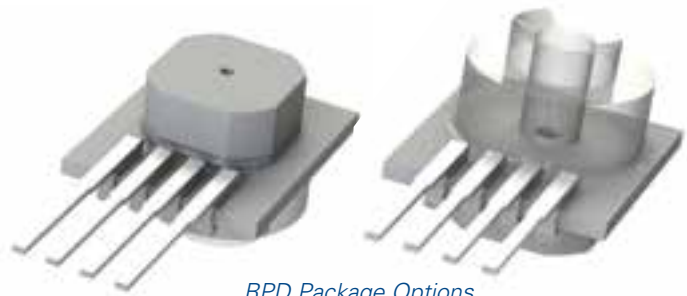
RPD Package Options