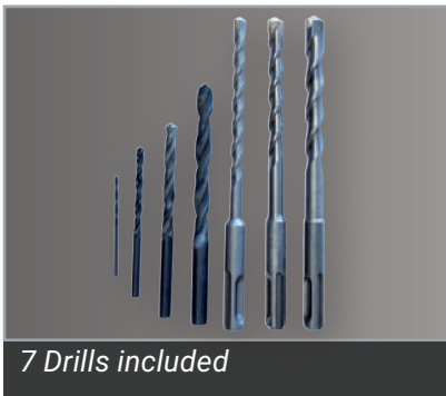
7 Drills included