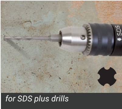
for SDS plus drills