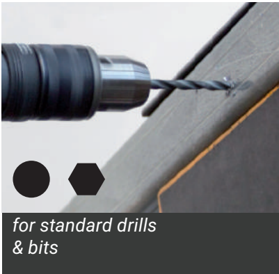
for standard drills & bits