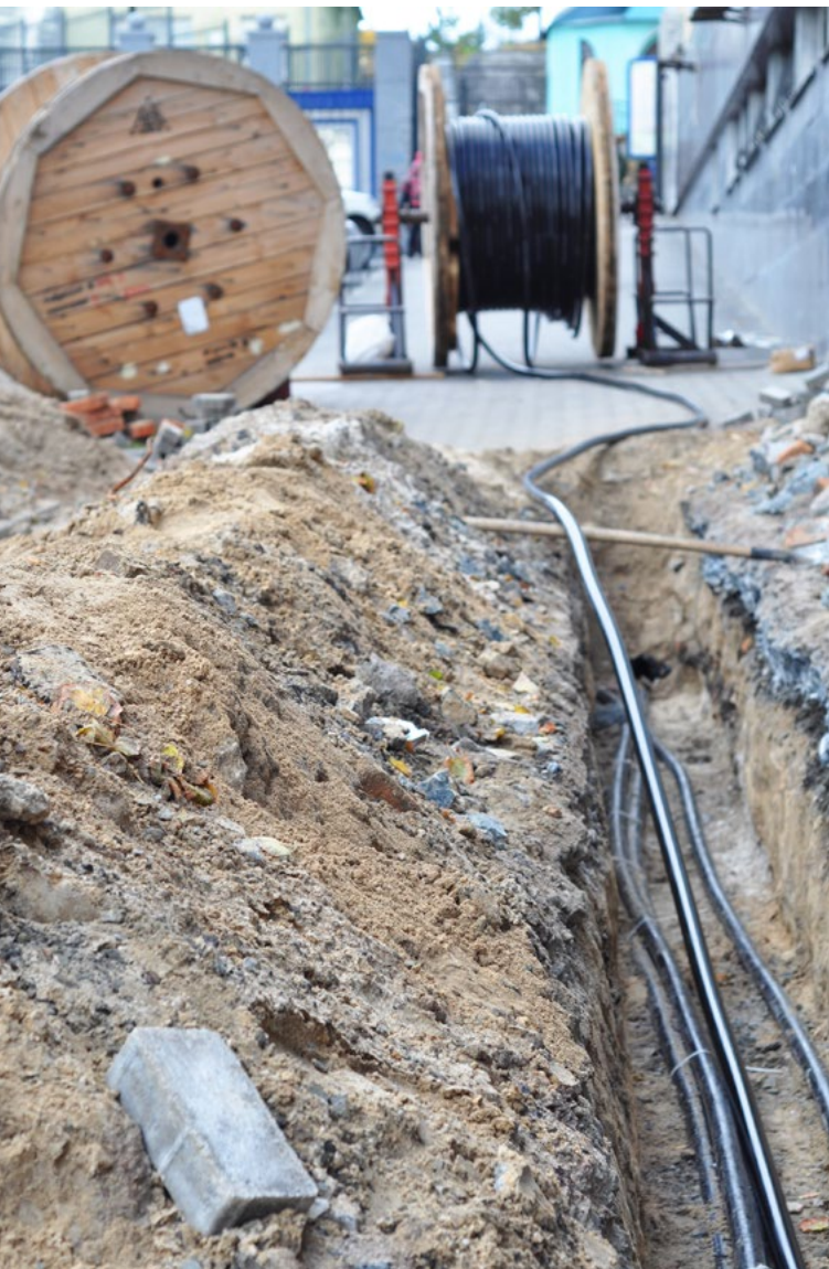
New installations or repairs: LV piercing connectors easily and safely connect all low voltage cables – even under voltage.

Live line working is increasingly essential in low voltage networks. Bolted connectors used for this purpose should be easy to install and ensure the best possible occupational safety. The LV piercing connector family from PFISTERER has been developed to meet today's practical requirements. Durable contacts come as standard, and have been a PFISTERER core competence for more than 100 years.