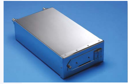
TB3049 thermal barrier