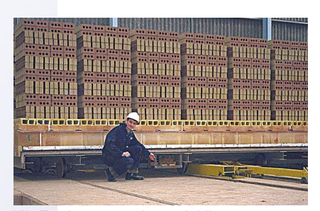
Kiln Tracker system beneath kiln car monitoring clay blocks

DATAPAQ® solutions for kiln profiling are specialized systems based on the kiln type. Tunnel kilns, clayblock firing, roller hearth kilns and hydro kiln solutions powered by Insight™ software for ease-of-use analysis have been the preferred method of profiling for leading manufacturers for many years.