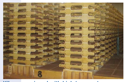
Kiln car equipped with high temperature antenna for RF telemetry