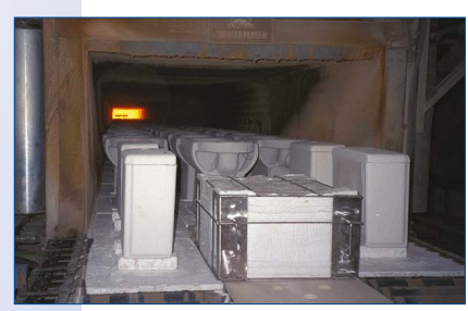
Kiln Tracker system in roller hearth sanitaryware kiln