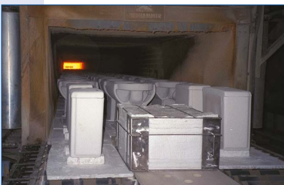
Kiln Tracker system in roller hearth sanitaryware kiln