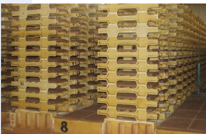
Kiln car equipped with high temperature antenna for RF telemetry