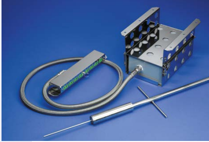
Thermal barrier with “in kiln” antenna