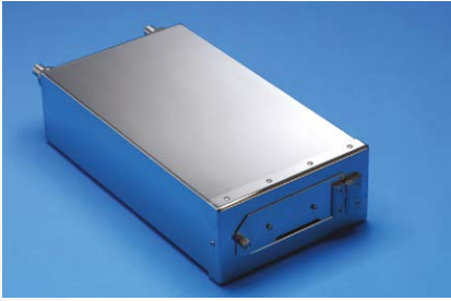
TB3049 thermal barrier