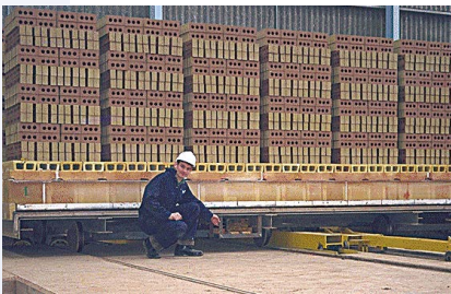
Kiln Tracker system beneath kiln car monitoring clay blocks

DATAPAQ ® solutions for kiln profiling are specialized systems based on the kiln type. Tunnel kilns, clayblock firing, roller hearth kilns and hydro kiln solutions powered by Insight ™ software for ease-of-use analysis have been the preferred method of profiling for leading manufacturers for many years.