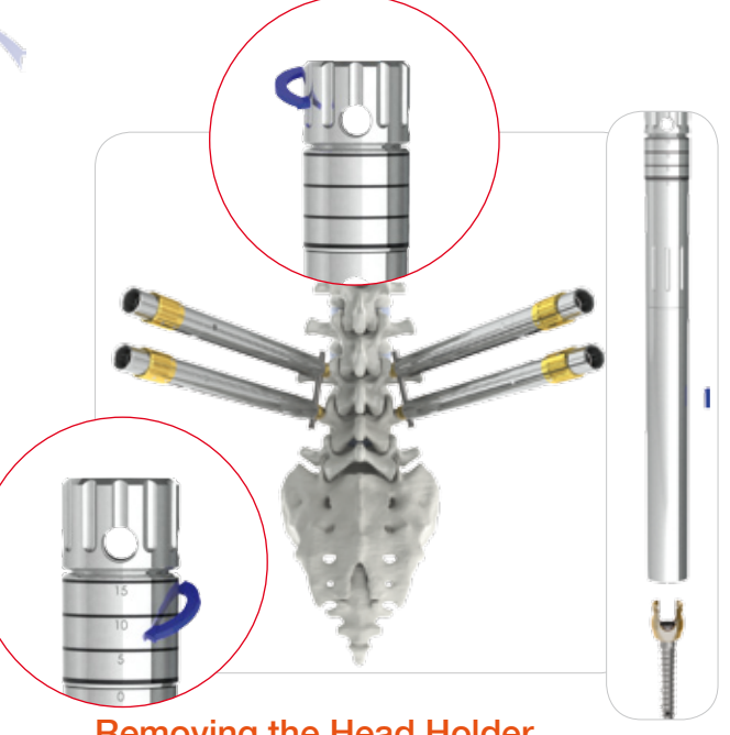
Removing the Head Holder

The full torque of 12 Nm is reached when an acoustic signal is heard.