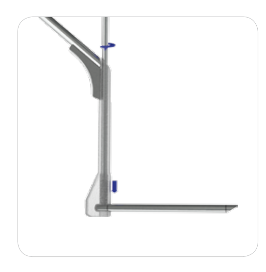
Rod Holder assembly III

The rod is fixed in the holder using the screw mechanism with the help of the Locking Screw Driver.