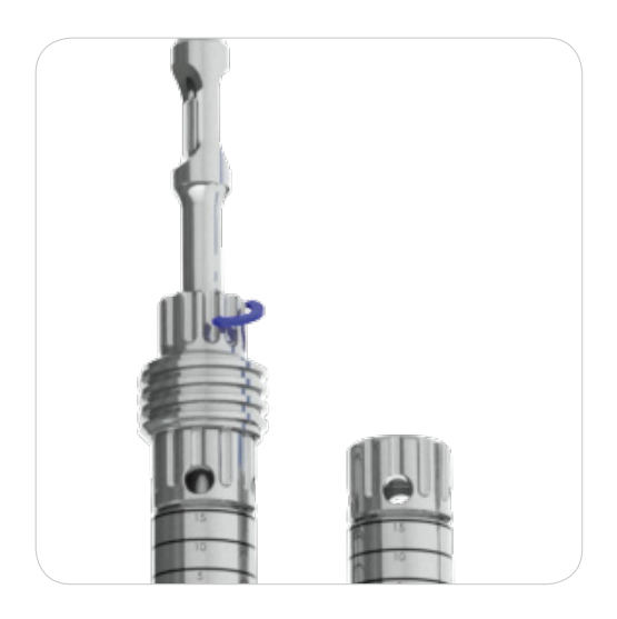
Fitting and tightening the Adapter Screw

The Adapter Screw is guided over the Set Screw Inserter to the Head Holder and tightened.