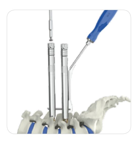
Inserting the Set Screw Inserter

Only tighten the threaded rod by hand, as otherwise complications can arise when loosening the Set Screw afterwards.