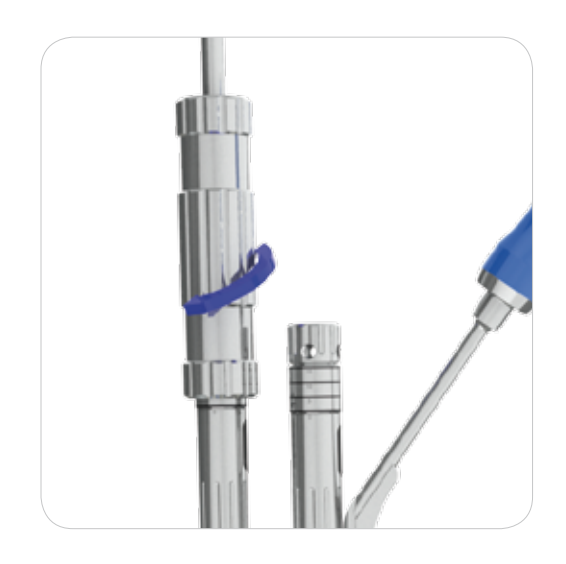
Fitting the Rod Pusher Handle

The Adapter Screw is guided over the Set Screw Inserter to the Head Holder and tightened.