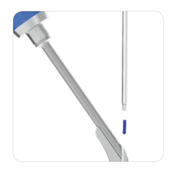
Rod Holder assembly II

Insert the selected rod into the Rod Holder. During this, ensure that the locking pin for the rod is screwed upwards. The rod is guided into the Rod Holder with the pre-assembled instrument holder so the locking pin can latch into it.