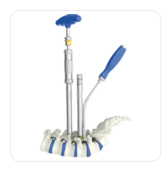
Tightening the Set Screw

Push the Rod Pusher Handle down and tighten it. During this, do not exceed the bottom-most marking line on the Head Holder as otherwise, the Set Screw will be pushed into the thread of the implant screw.