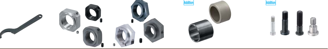
Hook Spanners for Bearing Nuts 767 Hard Lock Nuts for Bearings-Square/Hexagon Type- 768 Bearing Spacers -For Inner, Outer Ring- 769 Stopper Pins for Bearings 771