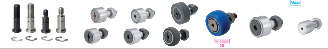
Stopper Pins for Bearings with Retaining Ring Groove 772 Cam Followers-Standard Type- 773 -Hexagon Socket Head Type- 774 Cam Followers Covered with Urethane 775 Resin Cam Followers 776 Solid Eccentric Cam Followers 776 Miniature Cam Followers 777