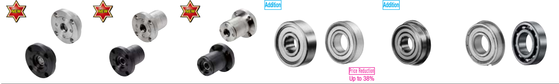
Angular Bearing with Housing sets-Flanged Type- 742 -Angular + Deep Groove / Flanged Type- 743 -Angular + Deep Groove / Inlay Type- 745 Small / Deep Groove Ball Bearings - Double Shielded- 747, 748 Small / Deep Groove Ball Bearings - With Flange- Deep Groove Ball Bearings - Double Shielded / Open- 749 750