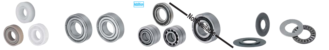
Resin Ball Bearings 755 Non-Grease, Non-Oil Ball Bearings for Special Environment 756 Angular Ball Bearings - Single / Double Row Combination (Standard)-Universal Combination (Precision)- 757, 758 Grease Seal Rings 758 Thrust Needle Roller Bearings 759