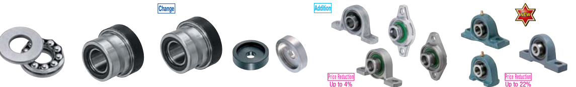
Thrust Ball Bearings 759 Needle Roller Bearings -With Thrust Ball Bearings- 760 -With Thrust Roller Bearings- 760 End Caps for Shafts 760 Ball Bearing Units - Pillow, Rhomb Flanged- 761 -Casting Pillow, Bottom Mount- 762