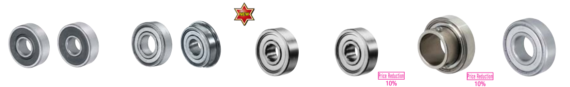
Small / Deep Groove Ball Bearings - Rubber Shielded- 751 Low Dust Raise Greased Ball Bearings 752 160°C Heat-Resistant Grease Filled Ball Bearings 753 230°C Heat-Resistant Grease Filled Ball Bearings 754 Bearings with Set Screws 755 1.4301/316/316L Ball Bearings for Special Environment