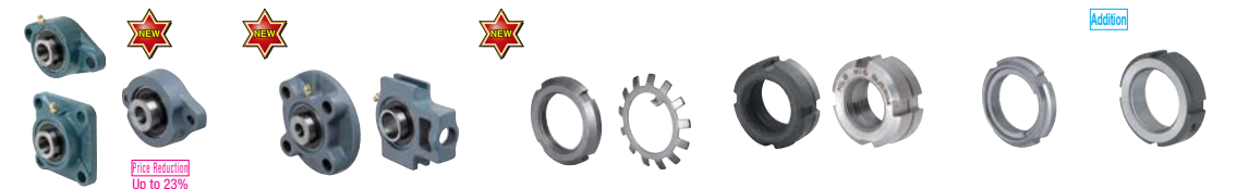
-Casting Flanged- 763 -Casting Inlay, Take-up- 764 Nuts for Bearings, Tooth Lock Washers for Bearings 765 Hard Lock Nuts for Bearings 766 Fine U Nuts® 766 Precision Lock Nuts 767