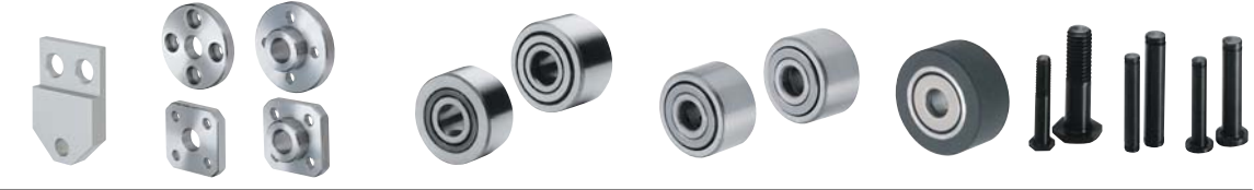
Brackets for Cam Followers 777 Bearing Covers 778 Roller Followers -Separate / Solid Type- 779 Roller Followers Urethane Type 780 Roller Follower Pins 780