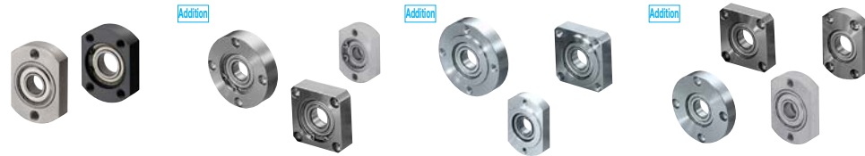
Product Name Page Bearings with Housings-Small Flanged Type- 694 -Retaining Ring Type- 695 -Inlay-Retaining Ring Type- 697 -No Retaining Ring Type- 699