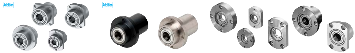
Inlay Double Bearing without Retaining Ring, L Selectable / Dim. Specified- 715-718 -Inlay Long Double Bearing without Retaining Ring, Dimension Specified- 719 Low Dust Raise Greased Bearings with Housings-Single and Double- 721,722