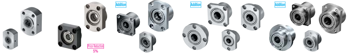
-Thrust Bearing- 701 -Short Double Bearing with Retaining Ring- 702 -Double Bearing with Retaining Ring, L Selectable / Specified- 703-706 -Double Bearing without Retaining Ring, L Selectable / Specified- 707-710 -Inlay Double Bearing with Retaining Ring, L Selectable / Dimension Specified- 711-714