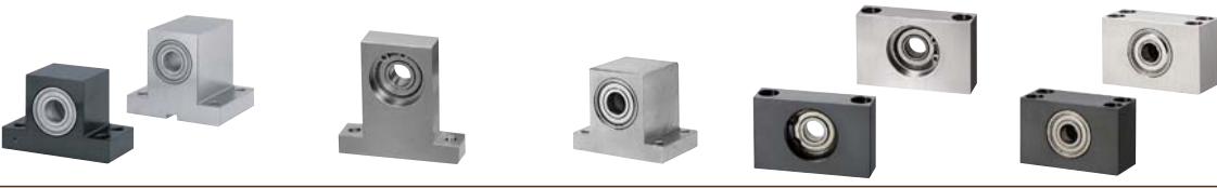
-T-Shaped Double- 730 Low Dust Raise Greased Bearings with Housings-T-Shaped- 731 -T-Shaped Double- 732 Bearings with Housings-Block- 733 -Block Double- 734