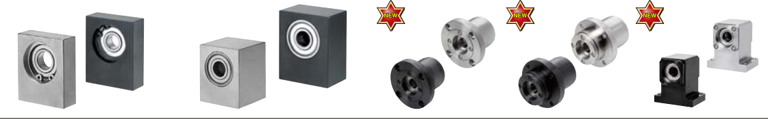
-Bottom Mount Height Selectable / Specified- 735 -Double Bottom Mount Height Selectable / Specified- 736 Bearings with Housings - Outer Ring Fixed Type- 738 -Outer Ring Fixed, Inlay Type- 739 -Outer Ring Fixed, T-Shaped Type- 740