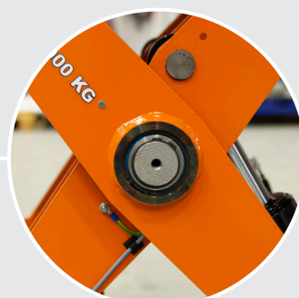
Lube for life bearings