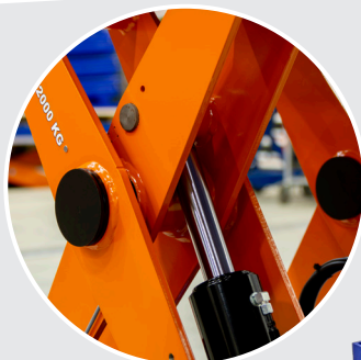
Dual flat steel scissor arms