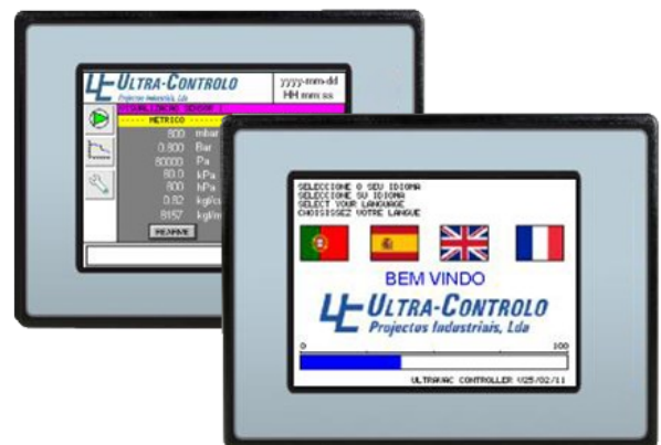
Building Management System with QuVAc