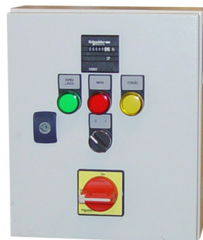
Control Box for one suction pump Simplex system