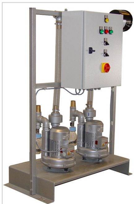
Example of Anaesthetic Gas Scavenging System with Variable Speed Units for energy saving

ULTRASEG systems are designed and manufactured under an ISO 13485:2003 and ISO 9001:2008 Quality Management Systems.