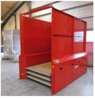
Custom-made for 2400x1200x160 mm platforms