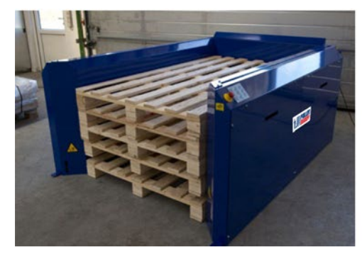
Custom-made for 2015x900x137 mm pallets