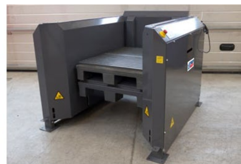
Custom-made for 1060×750×175 mm pallets