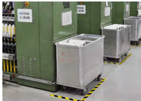
Cop, tube and bobbin transport