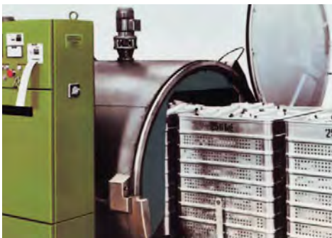
Steaming of cops and bobbins