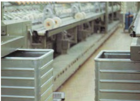
Cop and tube transport as well as storage