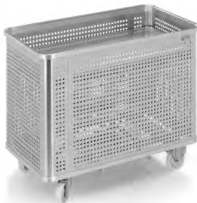
Cops trolley with spring-loaded base D 04