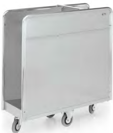
Roving bobbin trolley E 41