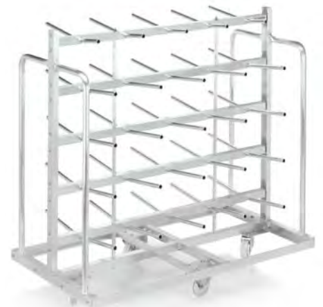
Bobbin trolley E 42