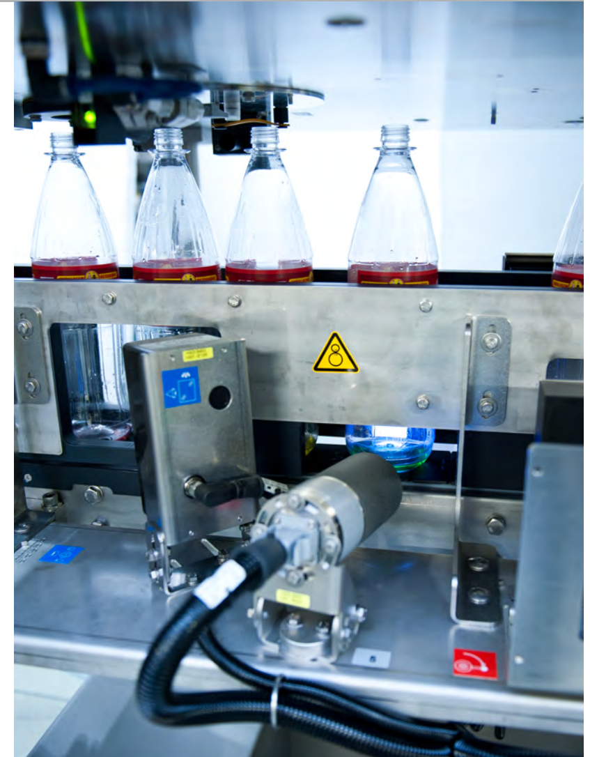
Liquid colour detection by camera

KRONES Remote Service provides you with round-the-clock expert advice and support. If required, a KRONES technician can access your inspector via a secure data link. This means parameter settings, software updates and fault analyses can be carried out rapidly and cost-effectively, with absolute security.