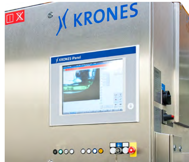
Ergonomic touch-screen operation