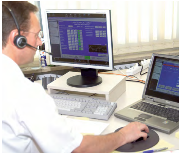
Remote maintenance using the remote service system

CCD camera for colour analysis of liquids with no gas phase