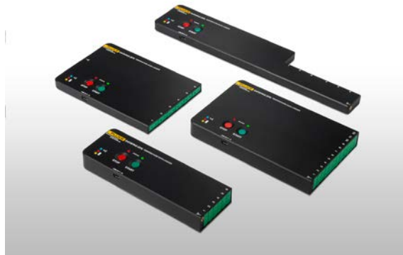
Datapaq DP5 data loggers

Included in Reflow Insight is the Easy Oven Set up (EOS) recipe calculation tool. EOS automatically calculates and informs the user of the optimum oven settings for a given product — saving time at every new product introduction.