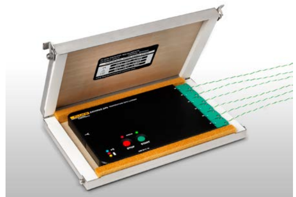
Datapaq DP5 data logger in thermal barrier

The Datapaq DP5 data logger can be specified with the optional TM21 radio telemetry system. This system has been designed specifically for use in high temperature conditions and providing the temperature readings in real time has proven its value in application from food cooking to steel slab reheating.