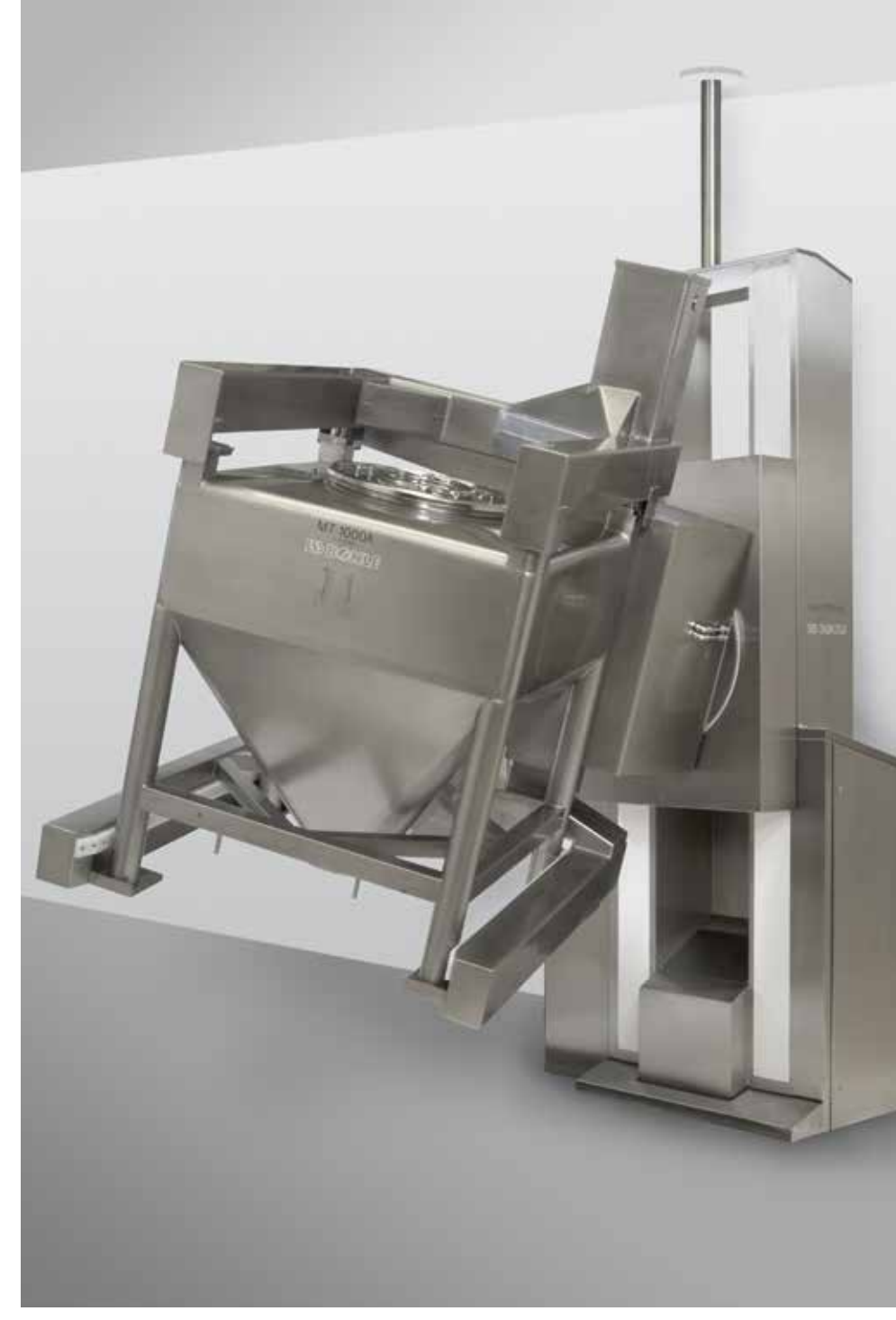
Bohle square blender PM 2400 with a MT 1000 container.

An extended hoist allows the blender to be also used as a milling station for bin to bin transfer.