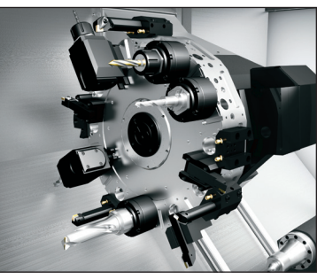
The ST-20SS is equipped with a 24-station hybrid turret that accepts BOT tools, 19 mm OD tools and VDI 40 tools.