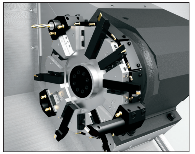
The ST-20 is equipped with a 12-station bolt-on style turret, with options for a 12-station VDI turret or a 12-station hybrid BOT/VDI turret.

The Haas ST-20 Series high-performance turning centers were designed from the ground up to provide set-up flexibility, extreme rigidity, and high thermal stability. Available in standard and Super Speed models, these 210 mm chuck machines offer the most performance for the money – the best value – in their class. With available high-torque live tooling and C axis, it's possible to machine multiple features and perform secondary operations in a single setup.